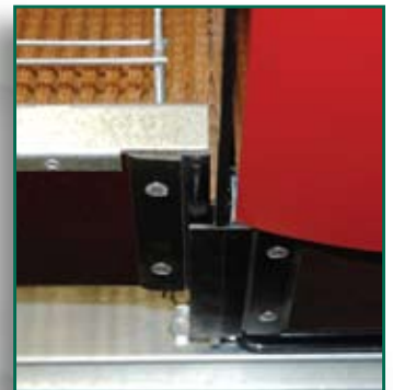
With slide together components, assembly is simple.