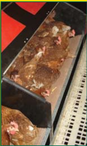
The Community Nest from VAL-CO is very inviting to your birds.