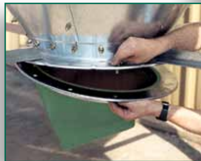
Boot attachment with the VAL-CO split collar allows for fast, easy installation.