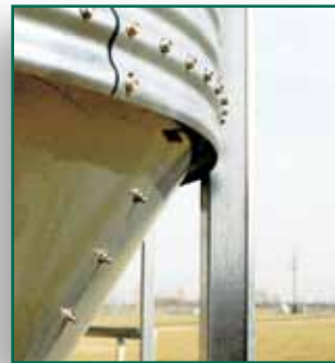
Drip edge directs moisture away from the taper hopper.