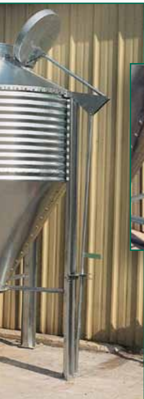
Above, the VAL-CO pinch-lock lid opener is easy to operate.