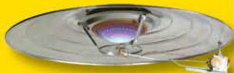
Pancake with Single Jet Burner