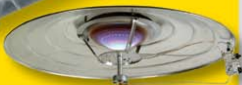
Pancake with Venturi Burner